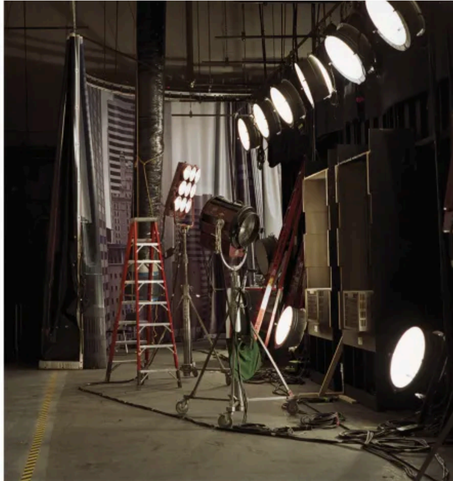
BUNGALOW PROJECTS CO-FOUNDERS SUSI YU AND TRAVIS FEEHAN, AND STAGE LIGHTS BEHIND A FILM SET.